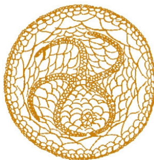
Isorophus cincinnatiensis Official Cincinnati City Fossil

The Dry Dredgers Department of Geology University of Cincinnati P.O. Box 210013 Cincinnati, OH 45221-0013