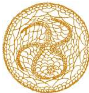
Isorophus cincinnatiensis Official Cincinnati City Fossil

The Dry Dredgers Department of Geology University of Cincinnati P.O. Box 210013 Cincinnati, OH 45221-0013